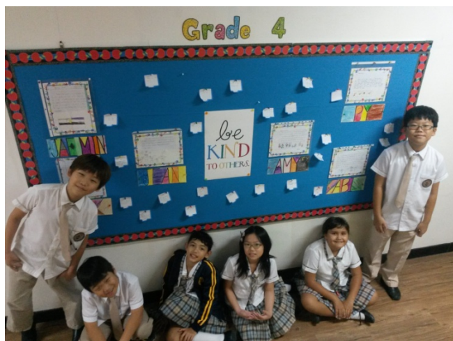
4 th Grade proudly displaying their "Be Kind" writing.